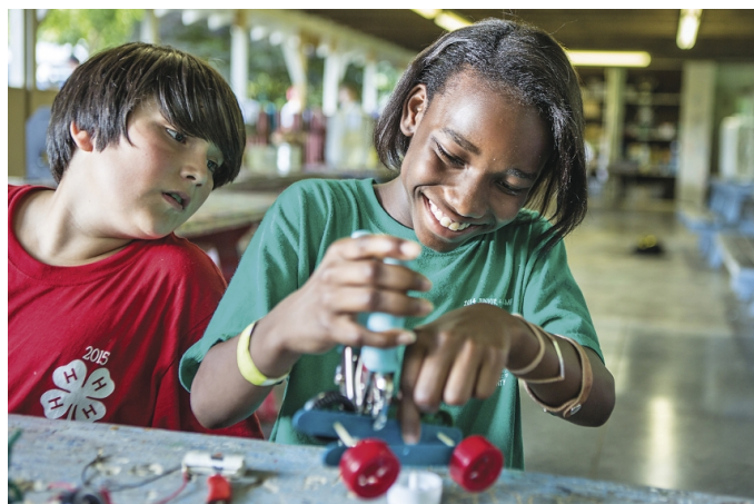
NATIONAL 4-H COUNCIL, TENNESSEE

IF YOU BUILD IT, THEY WILL COME: With classes like Junk Drawer Robotics, in which 4-H members create their own automatons, the venerable youth charity is boosting its appeal to modern kids.