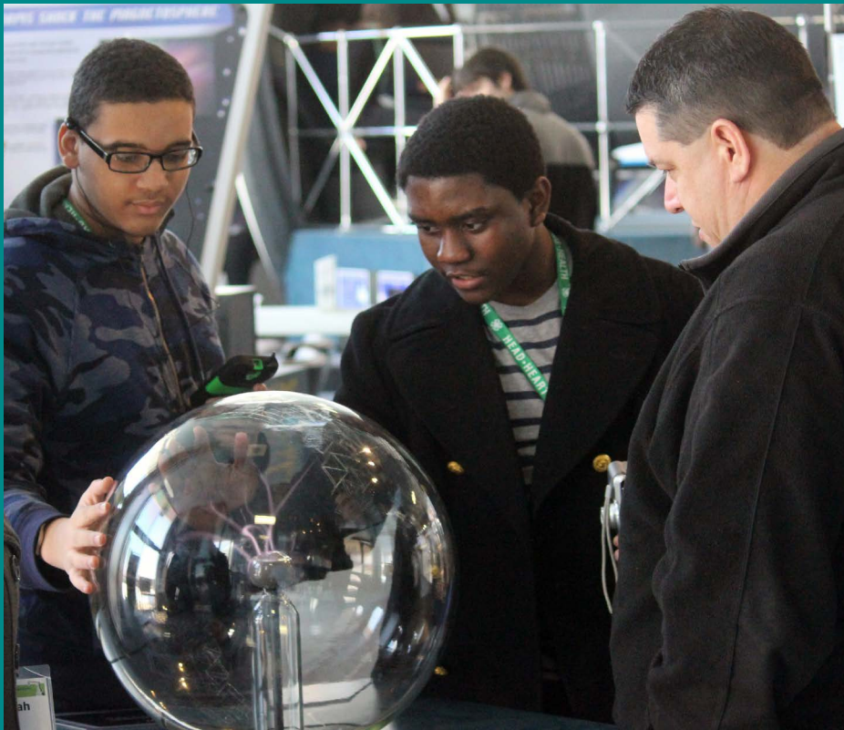
Students attending the National Youth Robotics Summit explore NASA's Goddard Space Flight Center