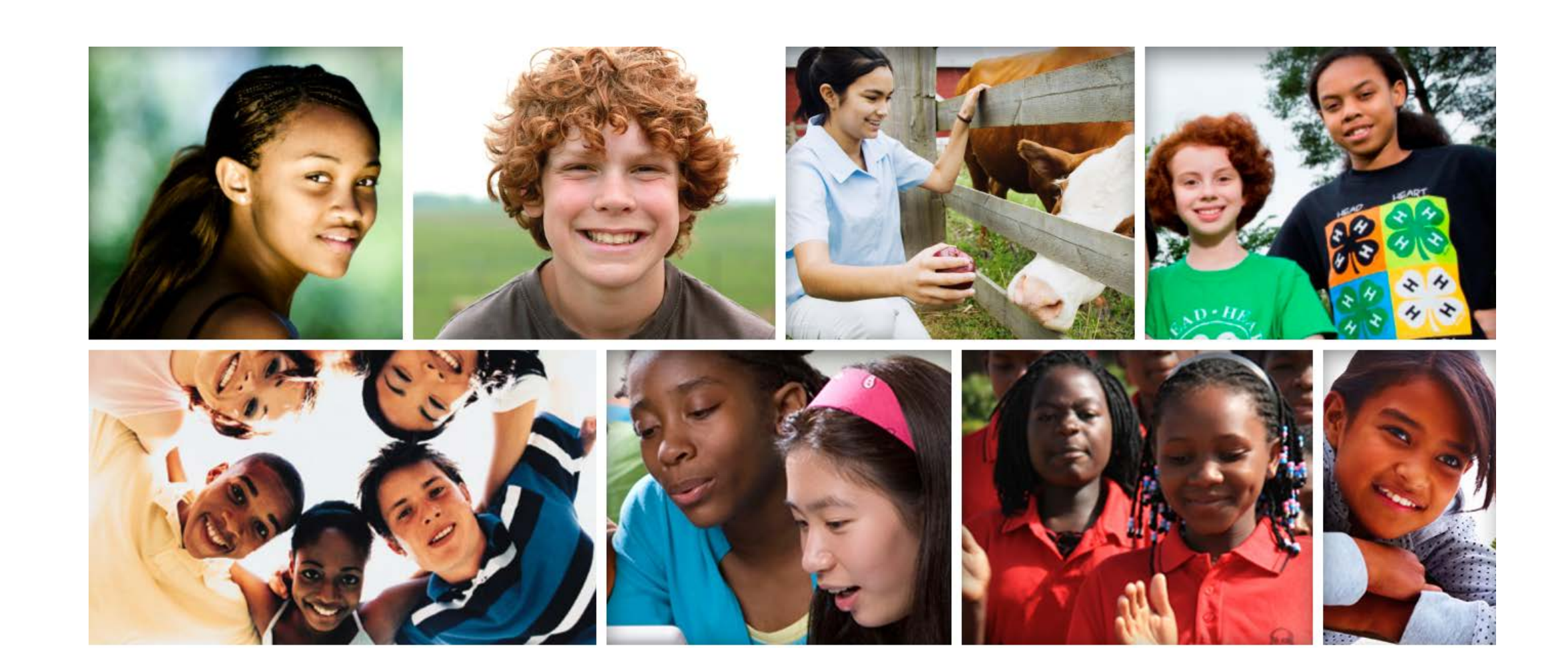
Lesson Study: Reflections on Teaching and Learning