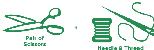
Pair of Scissors